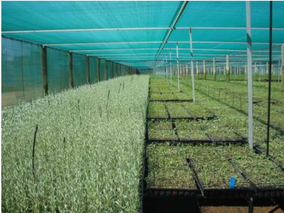
Oil Mallee Seedlings

Some of these projects have been submitted for funding and we await notification of their results.