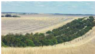
Direct seeded 4 row shelterbelt in the southern Mallee

Best results are achieved from belts located in the path of prevailing damaging winds and can be used to protect crops during establishment or stock during lambing/calving or 'off-shears'. Shelterbelts located high in the landscape (that is, on ridges) provide the greatest shelter distance. However, shelterbelts on slopes can still reduce the windspeed sweeping up exposed hillsides.