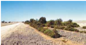
Utilising a roadside for shelterbelt establishment